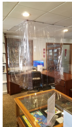
Protection for Reference Desk for Reopening During Coronavirus