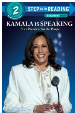
Kamala Is Speaking: Vice President for the People