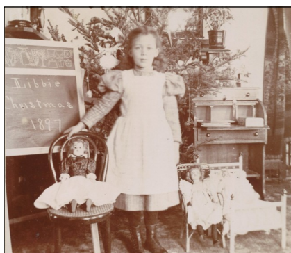
Libbie’s 1897 Christmas