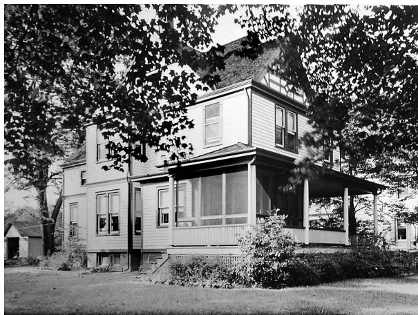
The Chapin home at 515 Oradell Avenue in 1933.