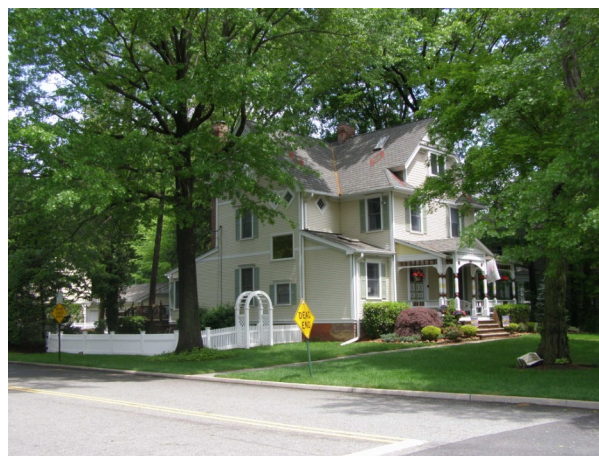
The Chapin home at 515 Oradell Avenue in 2011.