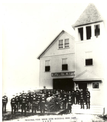
Oradell Fire Department 1897