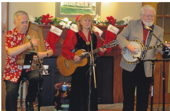
Triple Play Allstars at Christmas